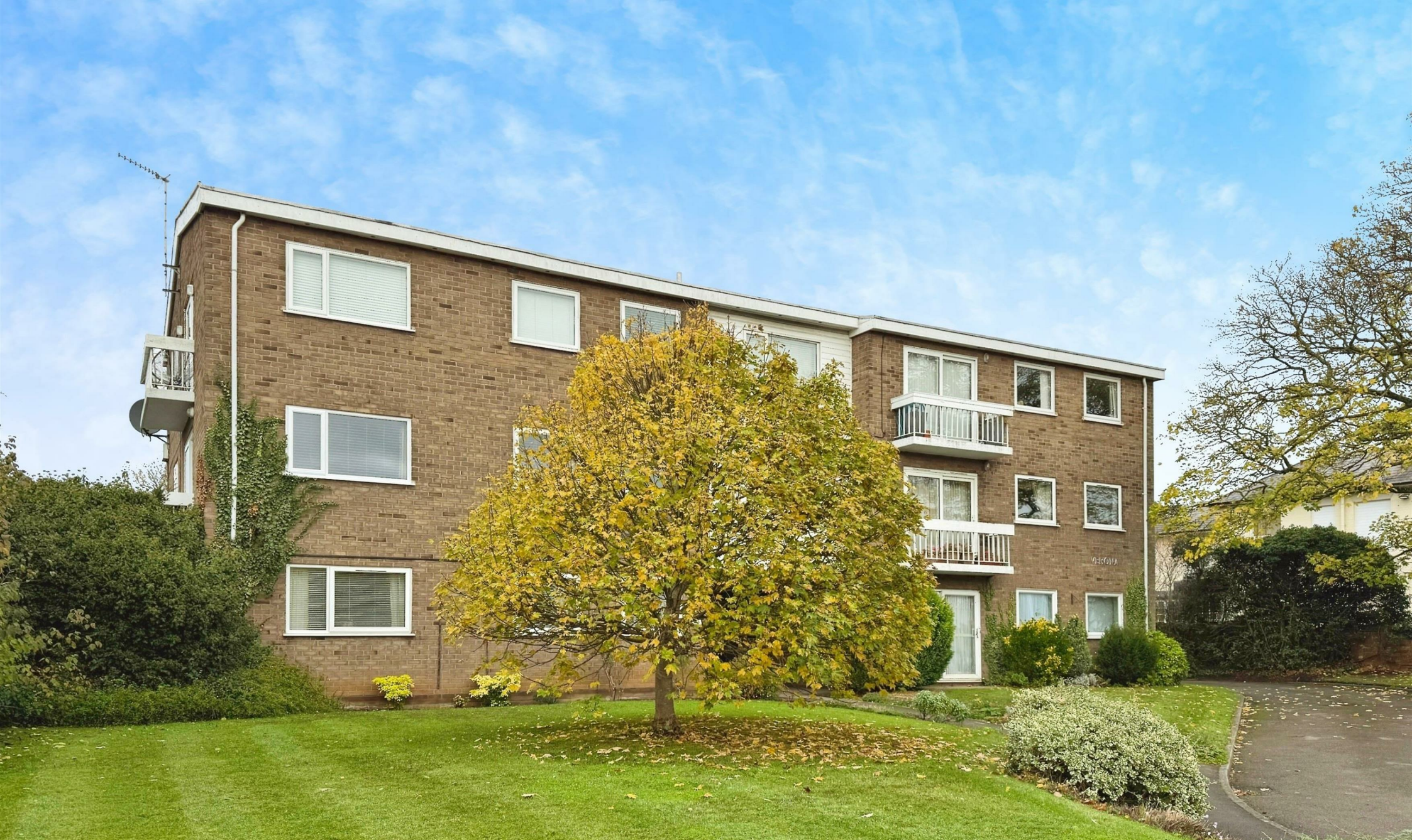
Warwick Court, Warwick Road , Stratford-upon-Avon, CV37 6YE